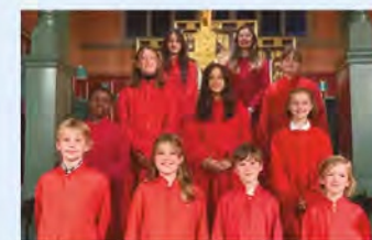
The St Michael's Choristers

Meet at St Michael & All Angels Church. £10