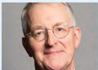
Rt Hon Hilary Benn, MP